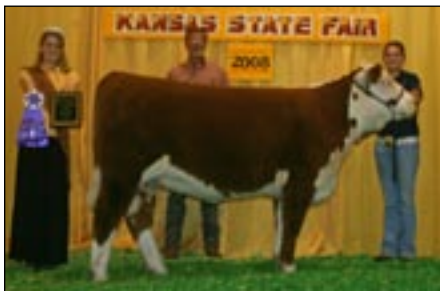
Champion female, Laken Lierle, Ft. Cobb, Okla., with TCL Gold Laryn 402, 5/15/07, by KW Golden Duke.